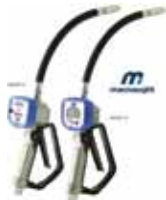
Image For Illustration Purposes Only - Shows Flexible Only

The MH40/MH50 is a low cost oil control gun with a fully integrated mechanical/LCD meter. Suitable for dispensing engine oil - gear oil - automatic transmission fluid and anti-freeze/anti-boil - with a maximum viscosity of SAE 140 - Features: Flexible extension - Meter with 4-digit resettable batch totalizer and 6 - digit accumulative totalizer - Protective shroud surrounding the meter - Robust aluminium handle with plastic trigger and guard - Dispenses up to 30l per minute (8 US gal per min) - Automatic non-drip nozzle.