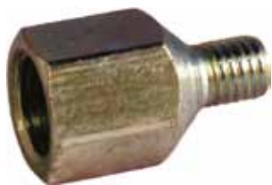
Straight Male Connector - Adaptor - Steel