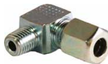
90° Compression Fitting - Steel