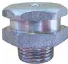
Lubrication & Fuel Systems - Tat Head - Stainless Steel 304