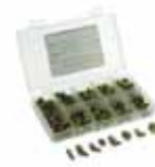
Grease Gun Accessories - 150 assorted straight & angled (BSP/BSF/UNF) - Housed in a handy box with compartments