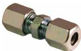
Straight Couplings - Steel