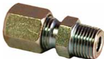
Straight Male Connector - Steel