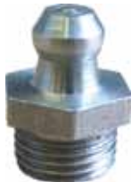
Lubrication & Fuel Systems - Straight - Stainless Steel 304