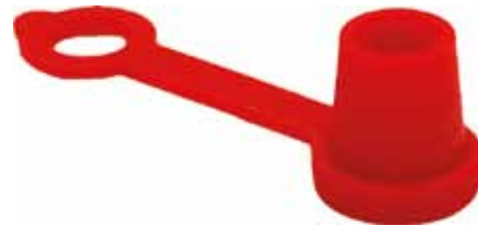
Grease Nipple Covers - Colour: Red