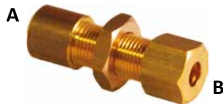
Battery Plate Adaptor - Brass