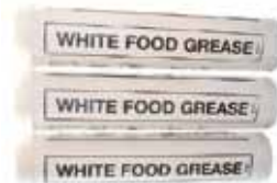
Lubrication & Fuel Systems - For Use In Food Processing Environments